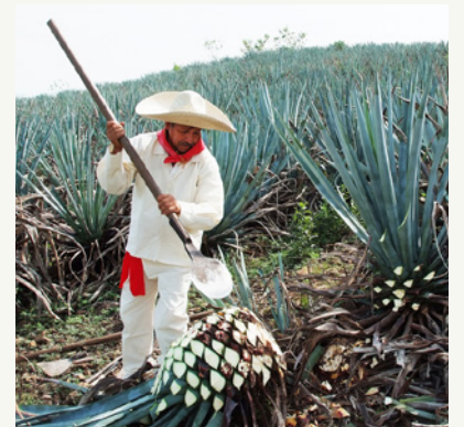
A jimador uses long-handled knife to harvest a pina from a field of blue agave.

Whichever style and however you prefer your tequila, it might be best not to delay. The rising popularity of the spirit is creating a shortage of agave, which could, in turn, lead to a shortage of tequila. Producers are preparing, however, planting more agave to meet the growing demand, but it can take years for the plants to mature.